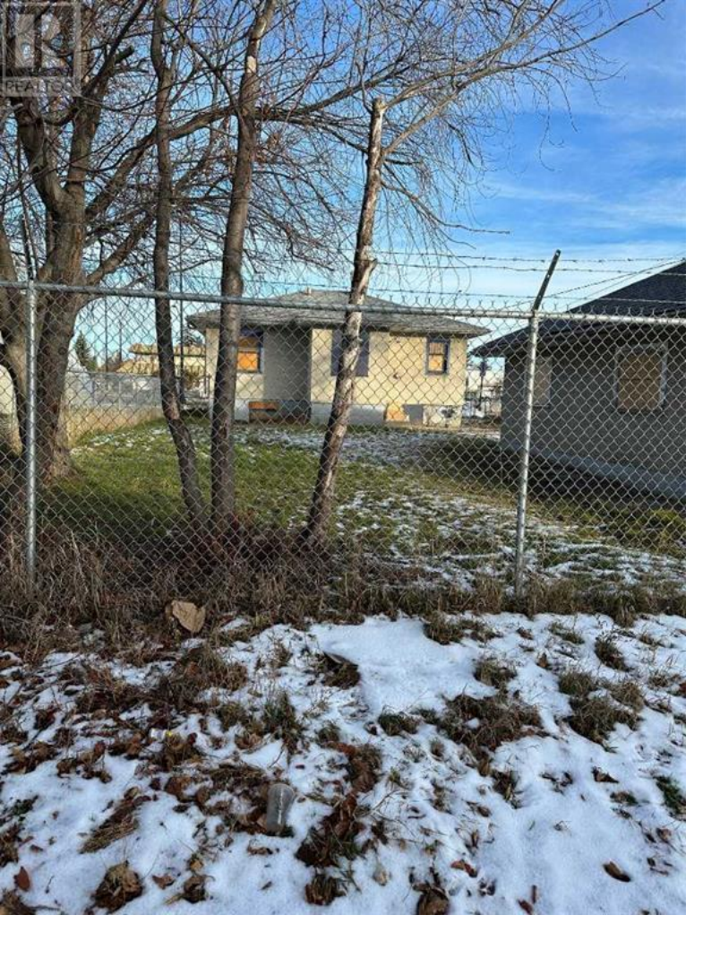
4405 17 Avenue Calgary Alberta