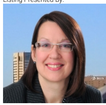
Originally Listed by: Real Estate Professionals Inc.