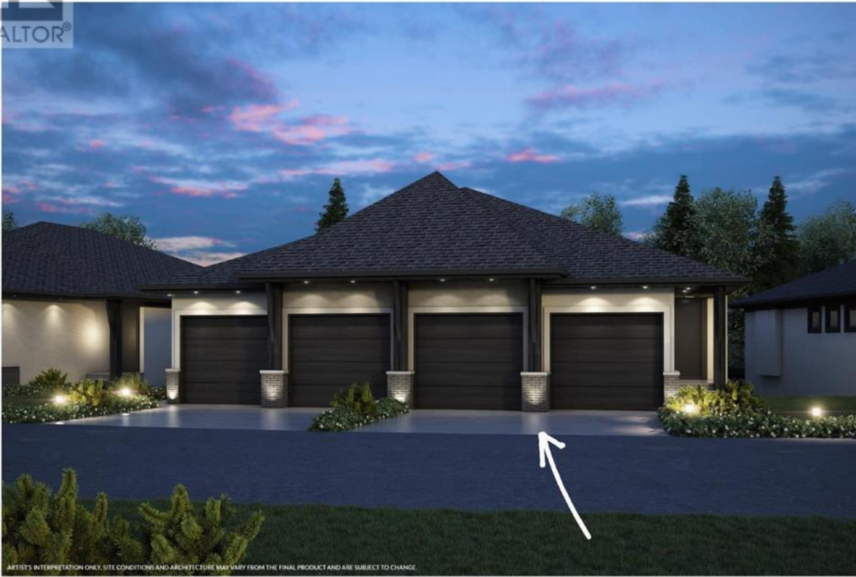
ARTIST'S INTERPRETATION ONLY. SITE CONDITIONS AND ARCHITECTURE MAY VARY FROM THE FINAL PRODUCT AND ARE SUBJECT TO CHANGE.

© Plans and selections depicted are subject to change and are copyrighted property of Lupi Luxury Homes.