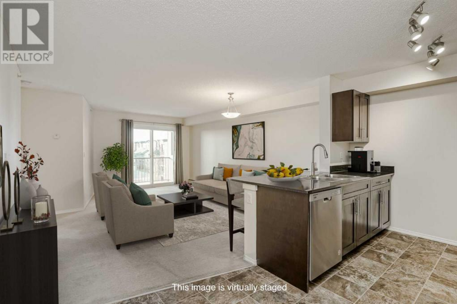
This image is virtually staged