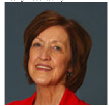
Originally Listed by: CIR Realty