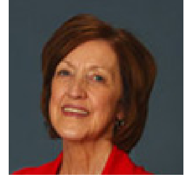
Originally Listed by: CIR Realty