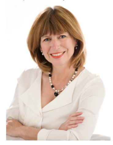
Originally Listed by: YMK Real Estate & Management Inc.