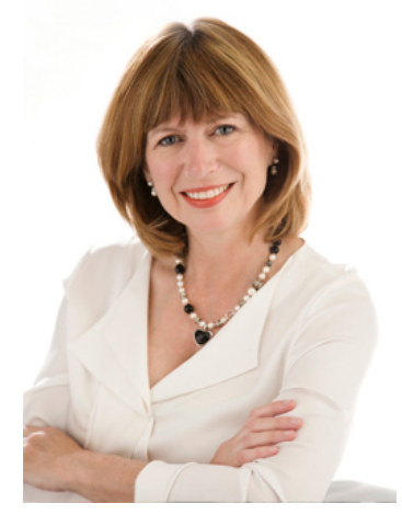
Originally Listed by: CIR REALTY