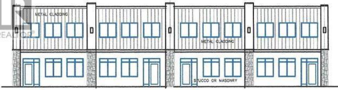
1 A-3 FRONT ELEVATION