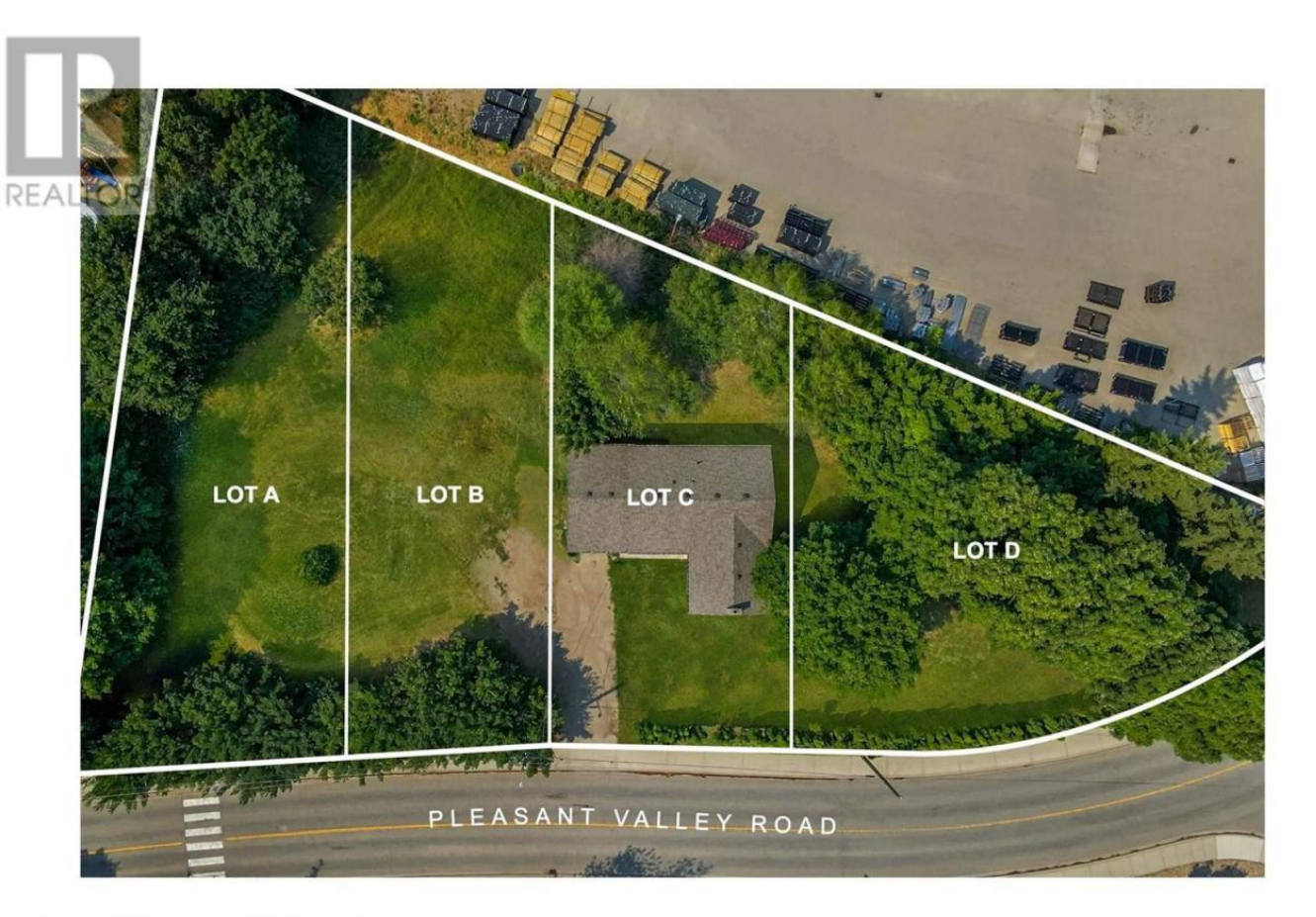
3035 Pleasant Valley Road