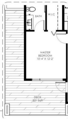
PARTIAL UNIT 'C4' @ 2ND - 4TH FLOOR SCALE: 3/16" = 1'-0" UNIT- #217, #317, #417 971.9 Sqft