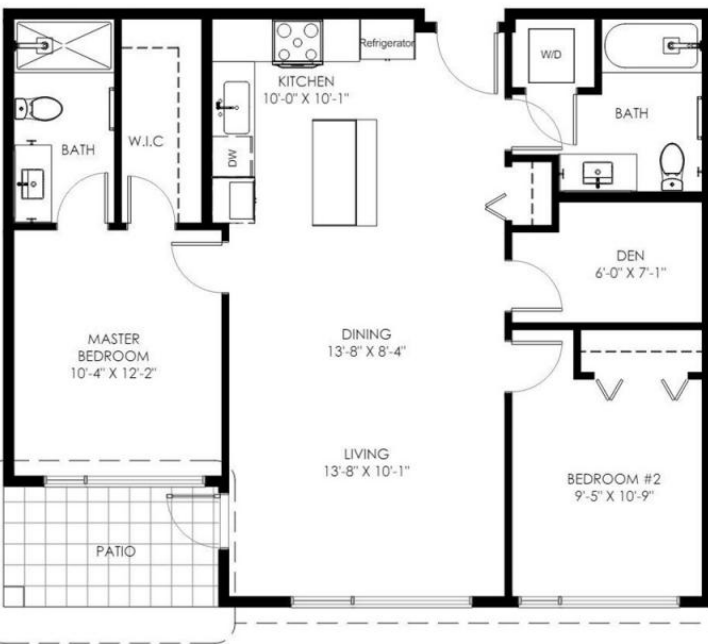
UNIT TYPE 'C4' PLAN L 2 BED+DEN SCALE: 1/4" = 1'-0" UNIT- #115 971.9 Sqft