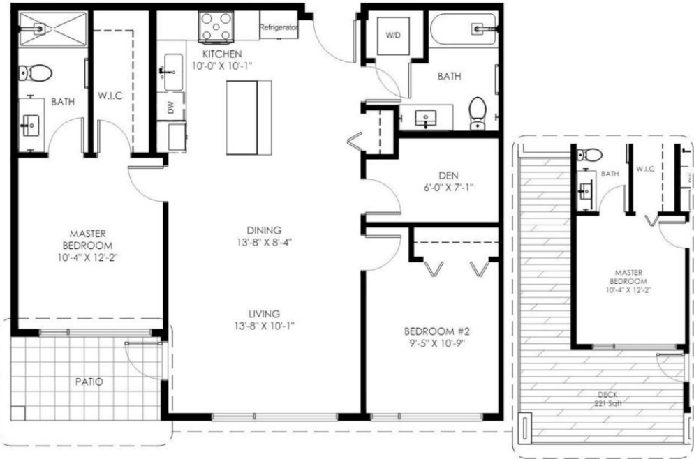
UNIT TYPE 'C4' PLAN L 2 BED+DEN SCALE: 1/4" = 1'-0" 971.9 Sqft UNIT- #115