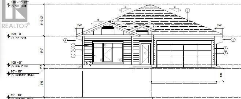
1 NORTH ELEVATION A3.1 3/16" = 1'-0"