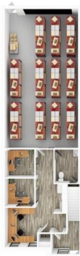
Ground Floor - Office & Warehouse