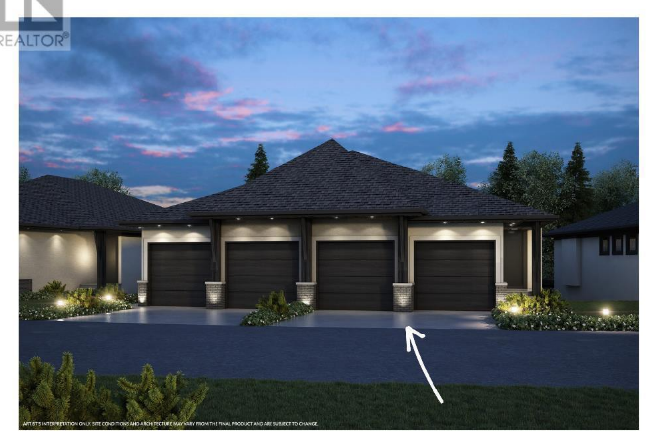
© Plans and selections depicted are subject to change and are copyrighted property of Lupi Luxury Homes.