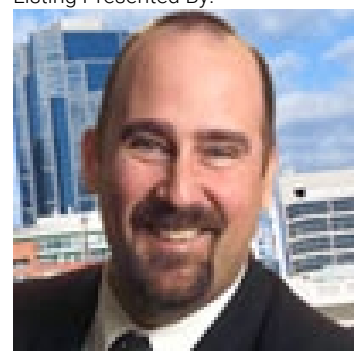
Originally Listed by: eXp Realty