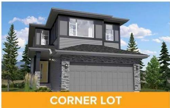
Actual product may differ slightly from the image shown.

$664,900 2,259 4 2.5 Dec - PRICE SQ. FT. BED BATH 2023 AVAILABILITY