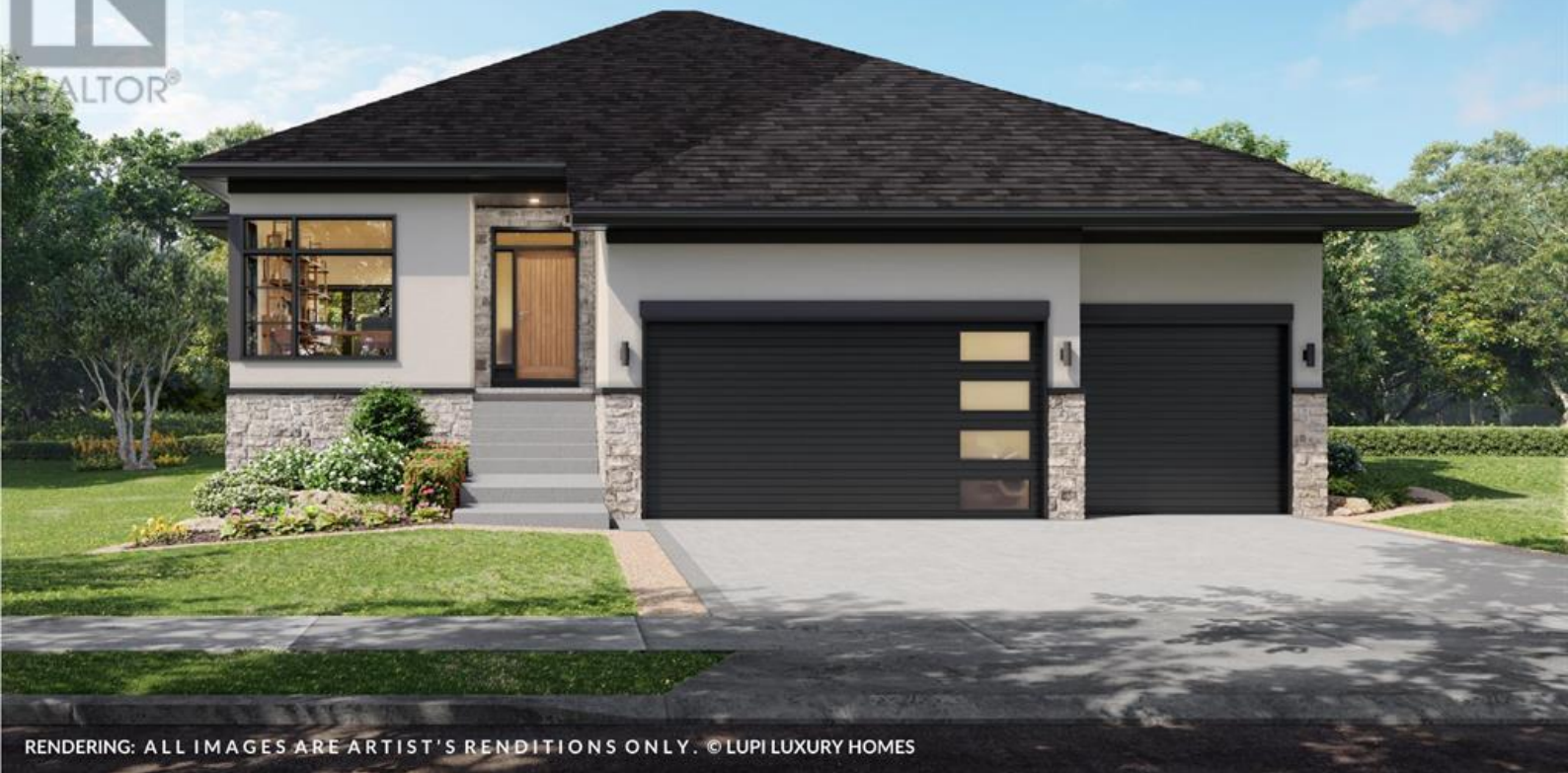
RENDERING: ALL IMAGES ARE ARTIST'S RENDITIONS ONLY. © LUPI LUXURY HOMES