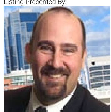
Originally Listed by: RE/MAX Real Estate (Mountain