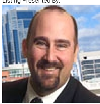
Originally Listed by: Century 21 Bravo Realty