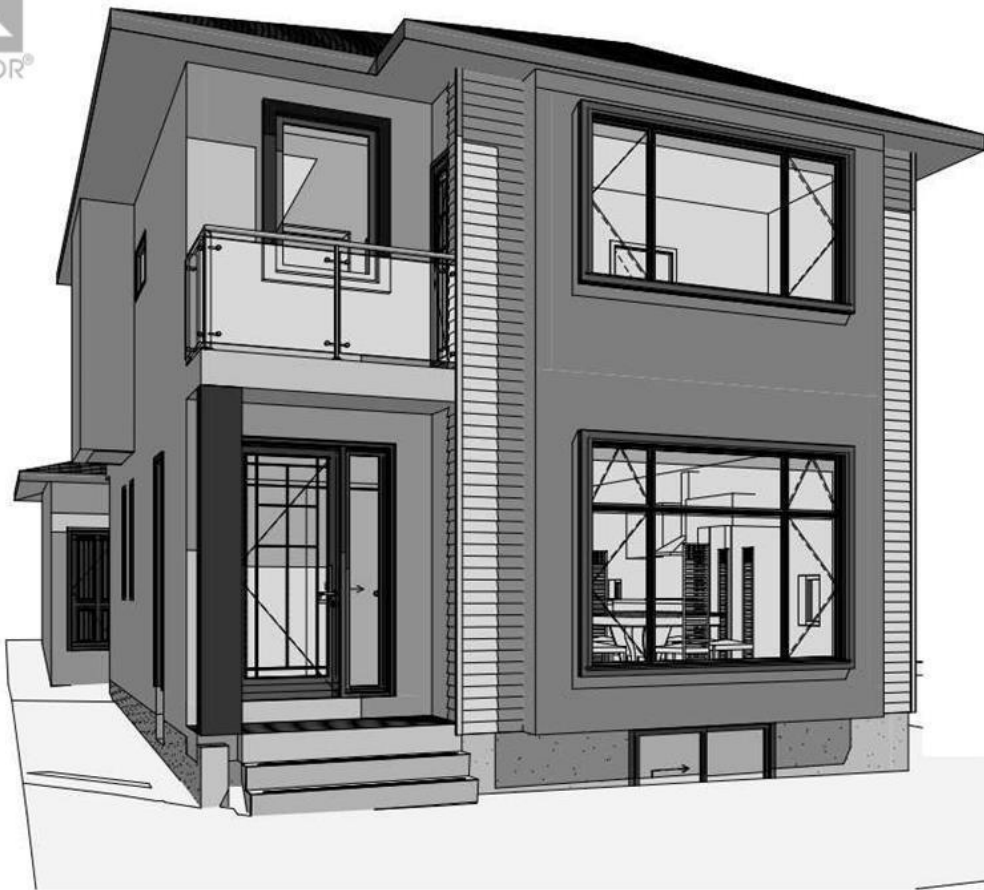
3D Perspective View