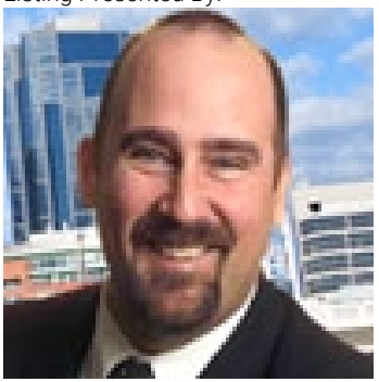
Originally Listed by: CIR Realty