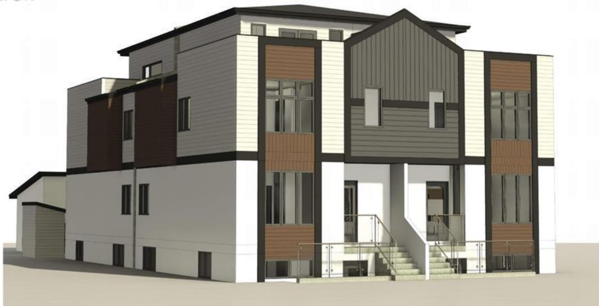
PROPOSED MULTI-FAMILY BUILDING 8532 46 AVE NW CALGARY, AB