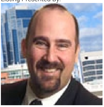
Originally Listed by: Real Broker