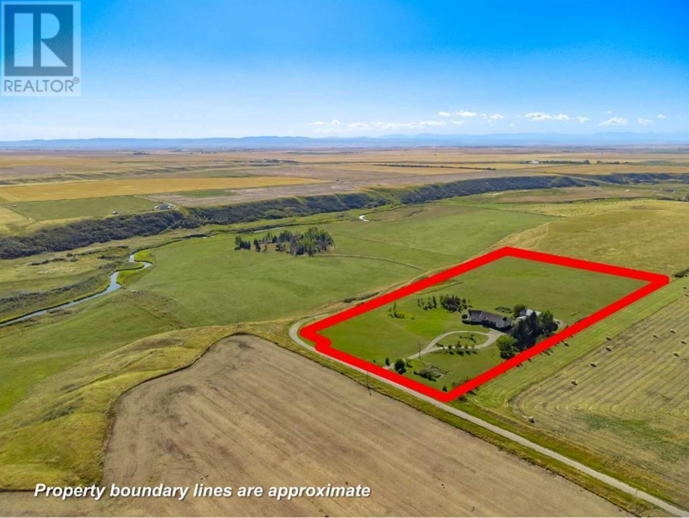
Property boundary lines are approximate