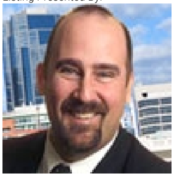
Originally Listed by: CIR Realty