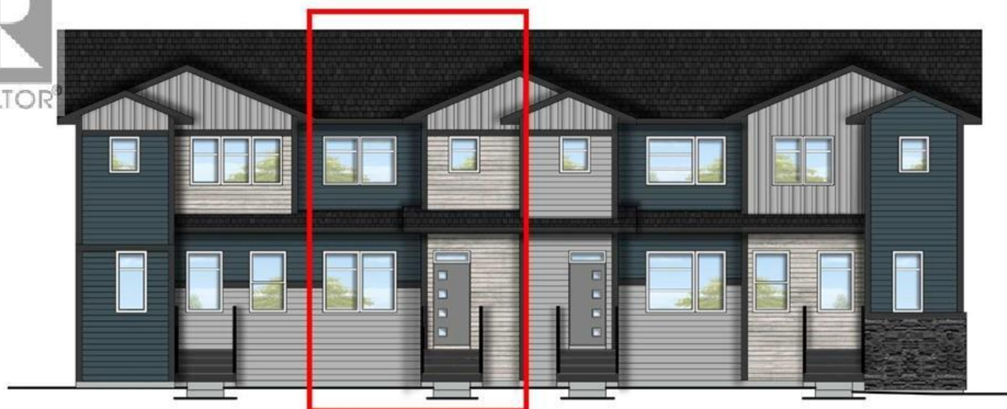
FRONT ELEVATION CRAFTSMAN CONTEMPORARY