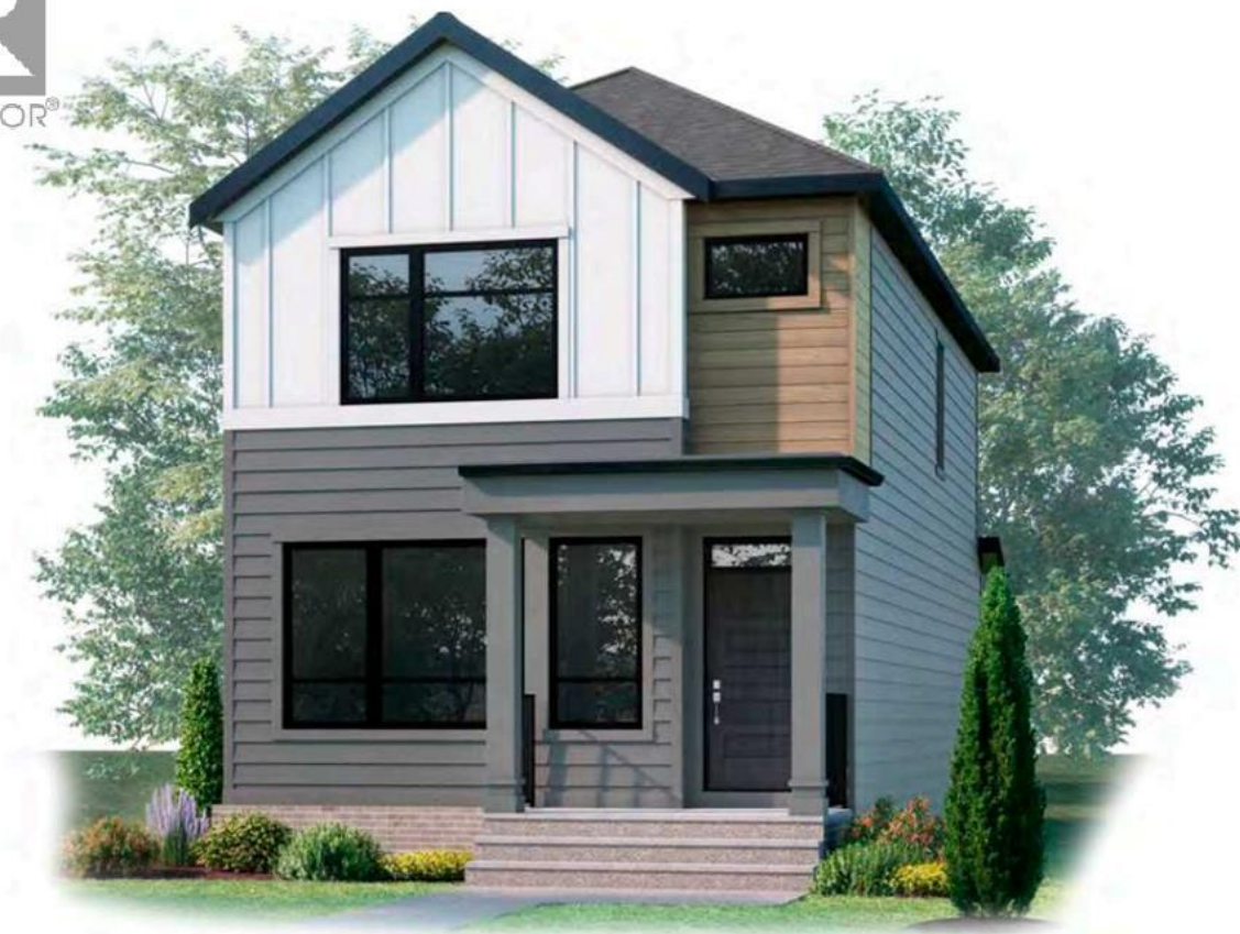
MODERN FARMHOUSE - AP1 EXTERIOR COLOURS ARE NOT EXACT