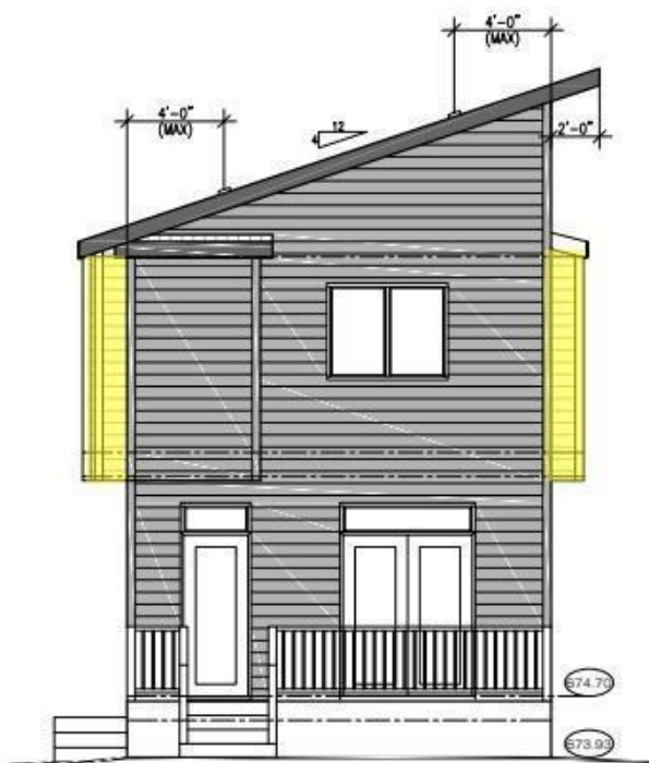
REAR ELEVATION SCALE: 3/16" = 1'-0"