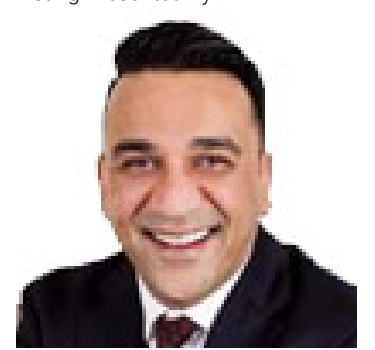
Originally Listed by: Real Broker