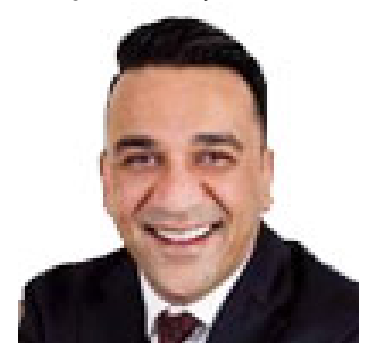
Originally Listed by: Century 21 Masters