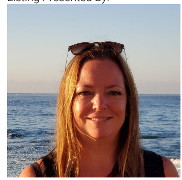
Originally Listed by: MaxWell Polaris