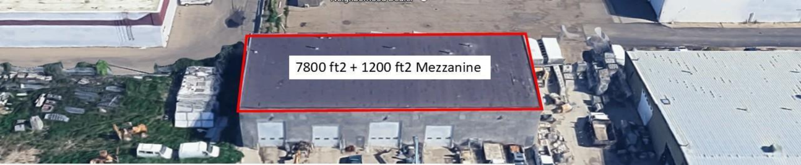
11544 154 St SHOP