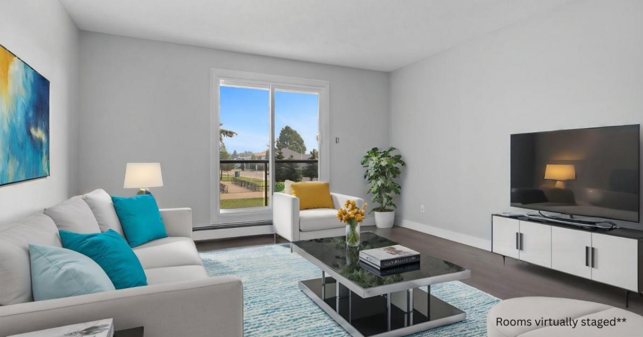
Rooms virtually staged**