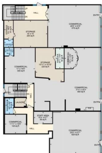
Main Floor Exterior Area 4305.20 sq ft