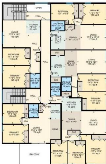
1st Floor Exterior Area 4384.51 sq ft