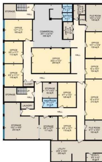
Basement (Below Grade) Exterior Area 4306.35 sq ft