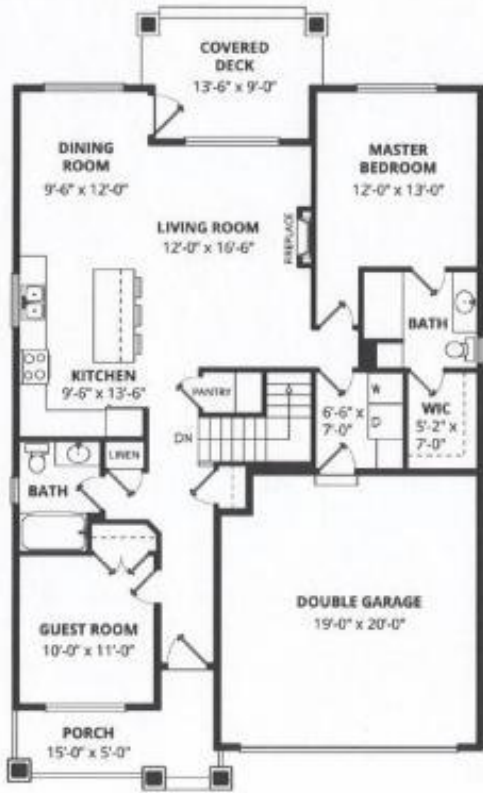
main floor 1,233 SQ.FT.