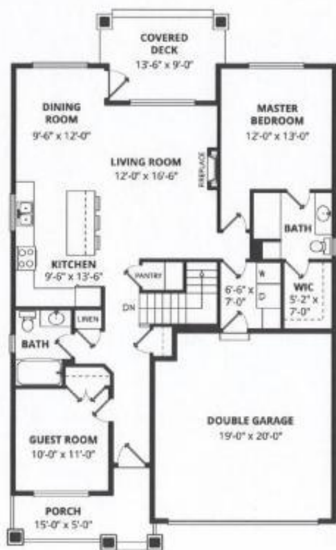
main floor 1,233 SQ.FT.