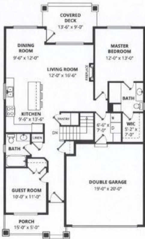
main floor 1,233 SQ.FT.