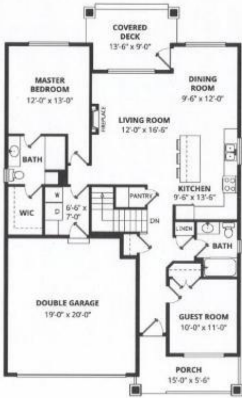
main floor 1,233 SQ.FT.