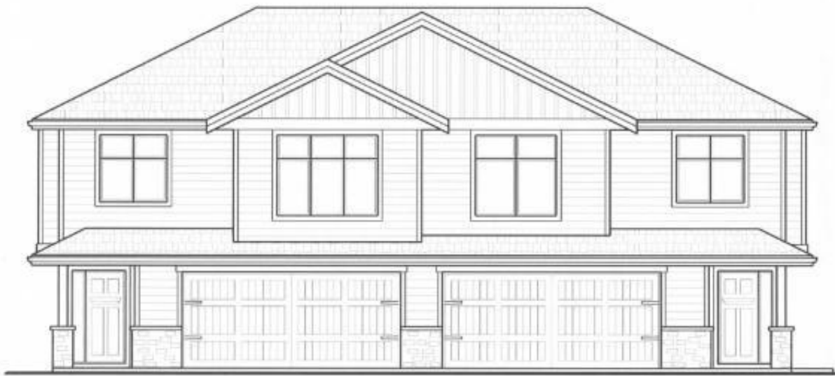
PLAN M-163 ELEVATION A