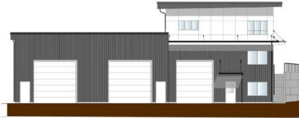
West Elevation Scale: 1/8" = 1'-0"