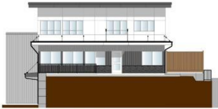
South Elevation Scale: 1/8" = 1'-0"