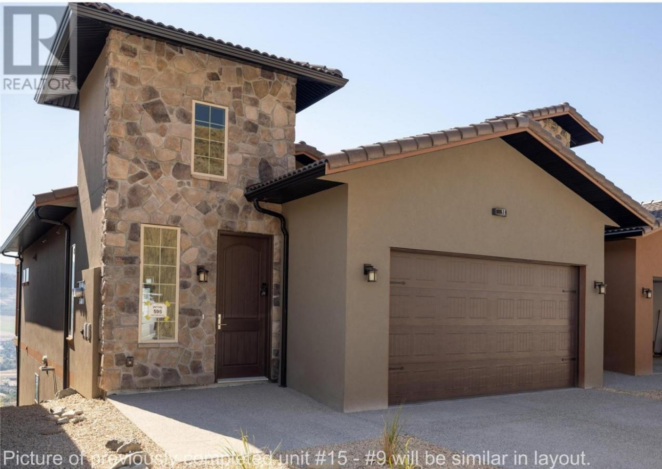
Picture of previously completed unit #15 - #9 will be similar in layout.