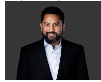
Originally Listed by: RE/MAX Vanderhoof