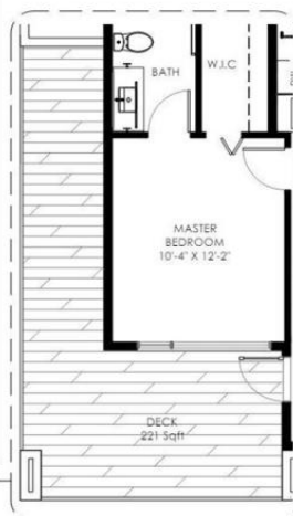
PARTIAL UNIT 'C4' @ 2ND - 4TH FLOOR SCALE: 3/16" = 1'-0" UNIT- #217, #317, #417 971.9 Sqft