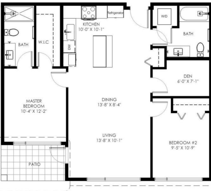
UNIT TYPE 'C4' PLAN L 2 BED+DEN SCALE: 1/4" = 1'-0" UNIT- #115 971.9 Sqft