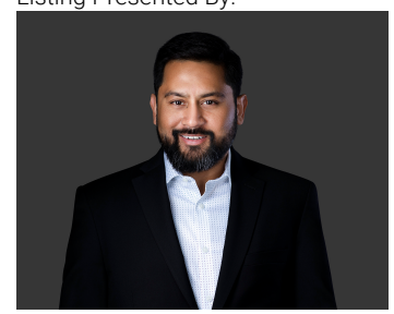
Originally Listed by: Easy List Realty http://www.easylist.realestate/