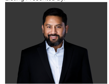
Originally Listed by: RE/MAX Kelowna