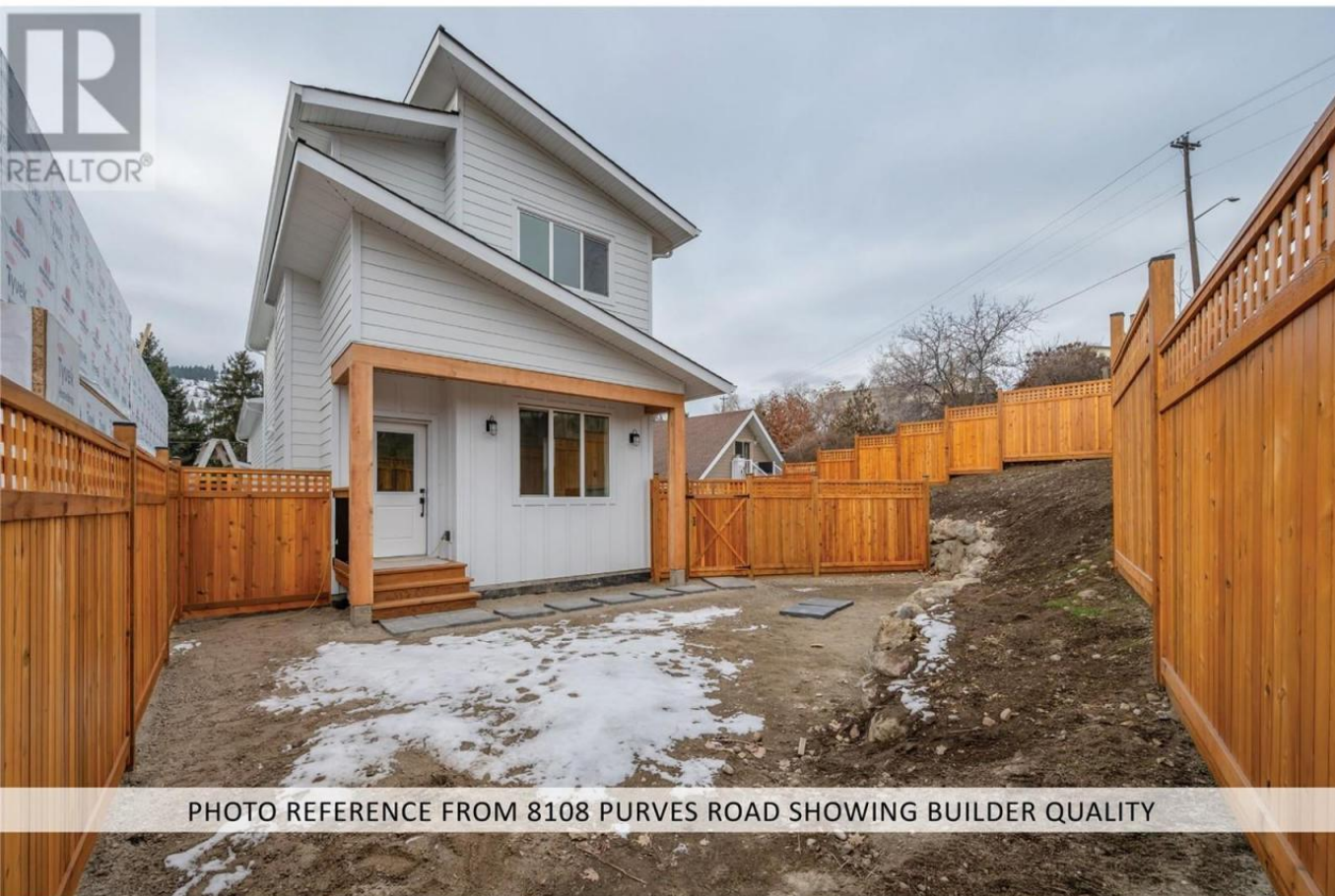
PHOTO REFERENCE FROM 8108 PURVES ROAD SHOWING BUILDER QUALITY