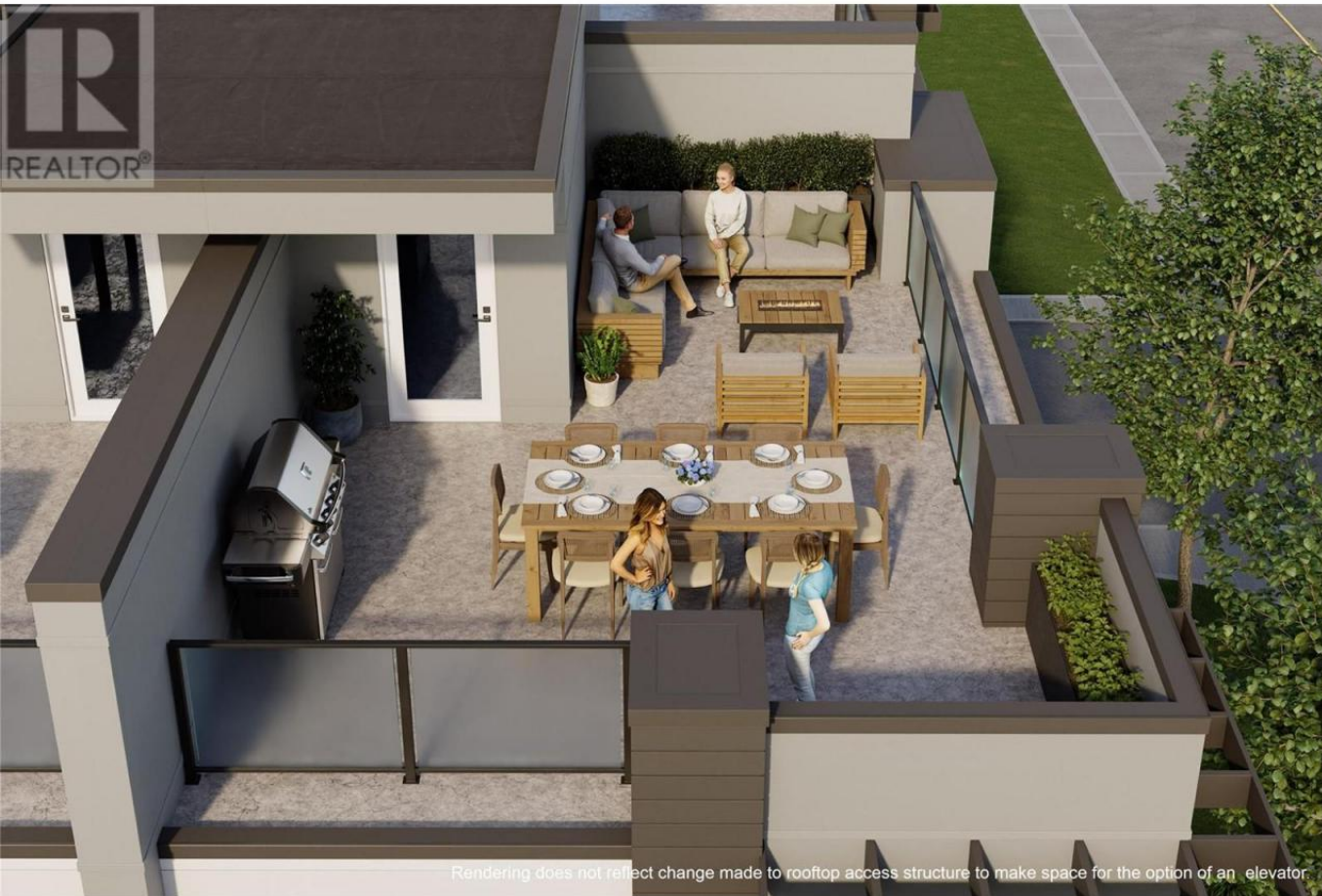
Rendering does not reflect change made to rooftop access structure to make space for the option of an elevator.