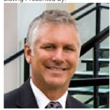
Originally Listed by: RE/MAX Kelowna