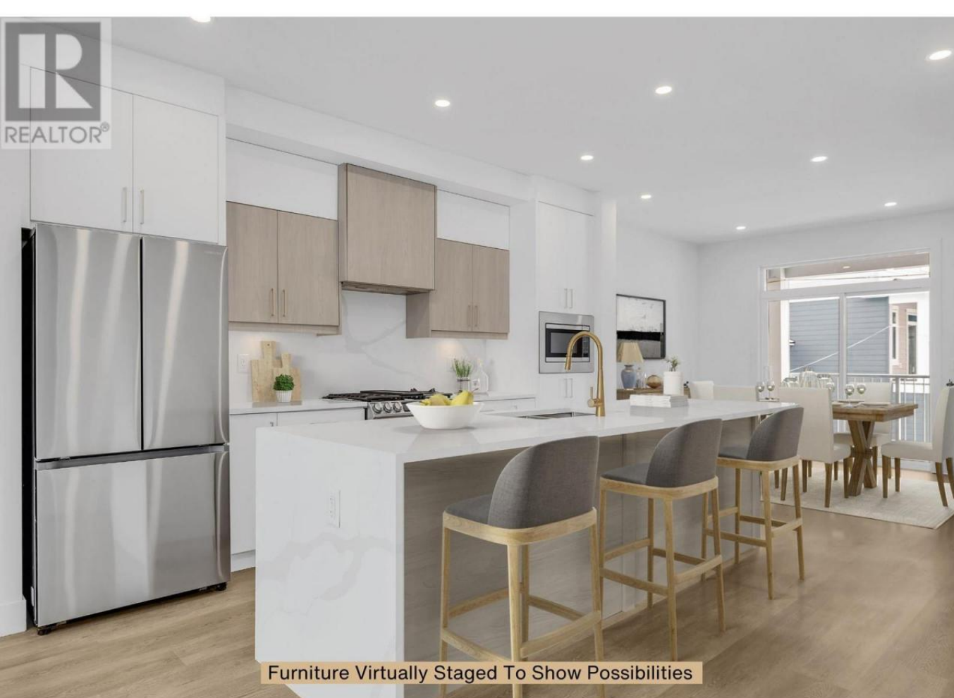
Furniture Virtually Staged To Show Possibilities