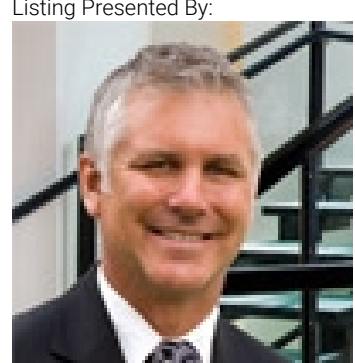
Originally Listed by: Royal LePage Kelowna