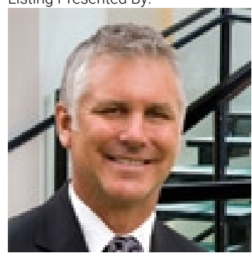
Originally Listed by: RE/MAX Kelowna - Stone Sisters