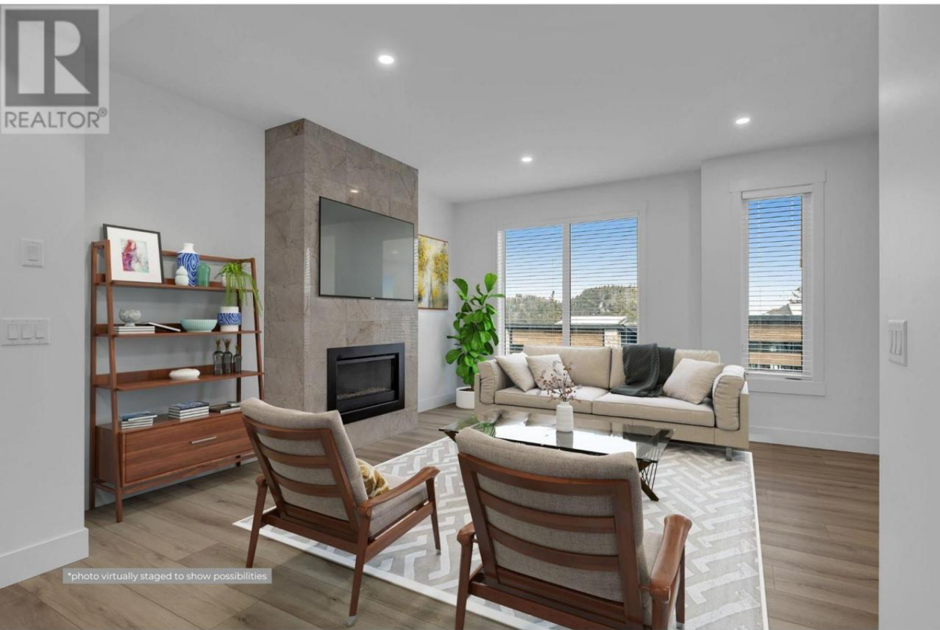
*photo virtually staged to show possibilities